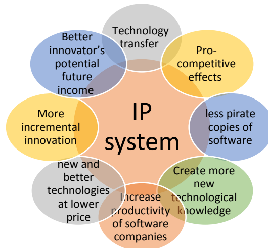
Figure 2: IP system benefits towards IT